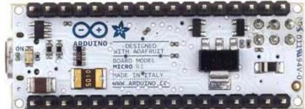
Arduino Micro Rear